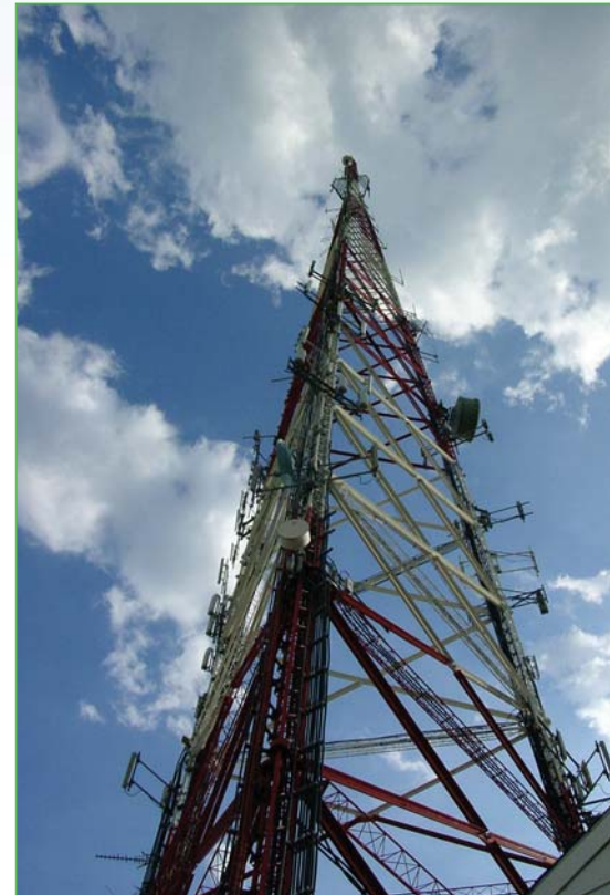
Ministering the Good News on Radio

Please complete the portion below and return in the envelope provided. Thank You.