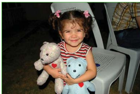
Iraqi Child Receiving Treasures