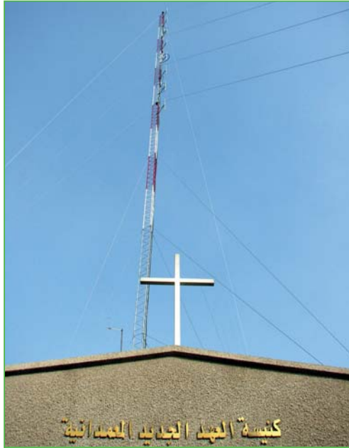
Broadcasting in Baghdad from Church