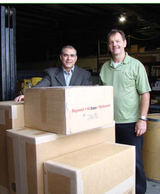
Delivering Broadcast Equipment in Tennessee