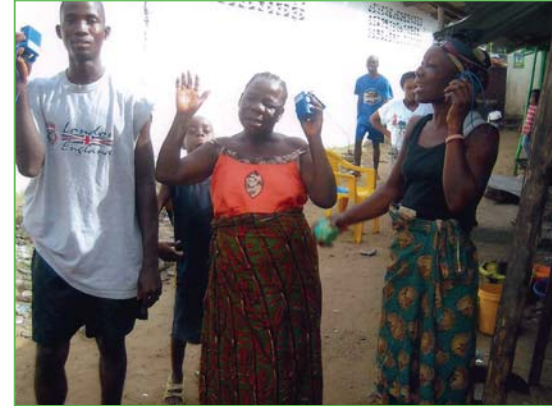
Liberians Listening to Worship FM on Galcom Radios