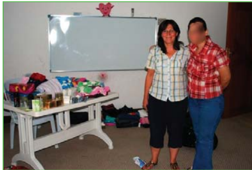
Insaf Delivering Gifts at Iraqi Women's Conference